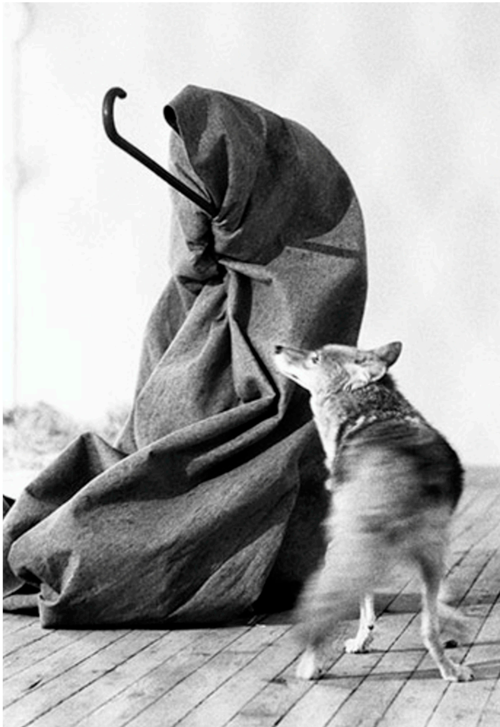
Figure 3. 'Coyote; I like America and America likes me' (Joseph Beuys, New York 1974).

Campbell: It is the function of the artist to do this. The artist is the one who communicates myth for today'. (Campbell 1991, p. 207)