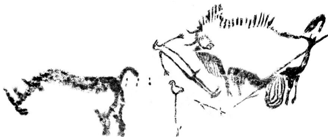
Figure 1. The scene in the shaft, Lascaux, Dordogne, (15,000 to 20,000 years BCE).

I begin by setting out the broad terms of my argument with three contrasting artworks from across cultures and through deep time, from prehistoric cave painting to contemporary art, which despite their obvious differences are related by virtue of the concept of shamanism which has been applied to them. The first is the so-called ‘scene in the shaft’ of the cave of Lascaux in the Dordogne, France (Figure 1), dating to between 15,000 to 20,000 years BCE. The scene in the shaft is typically interpreted as a hunting scene showing an eviscerated bison beside the hunter he has wounded (e.g., Gombrich 2007 ), as a form of sympathetic magic, the imagery painted in order to affect the hunt (e.g., Reinach 1903 ), or as a shamanistic visionary or trancing scene, one aspect of which might be the partial transformation of the shaman into a bird spirit ( Davenport and Jochim 1988 ; Lewis-Williams 2002 ).