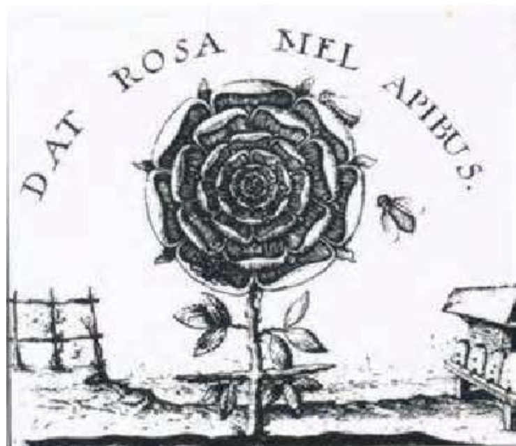
Robert Fludd's Sunnum Bonum Rosy Cross