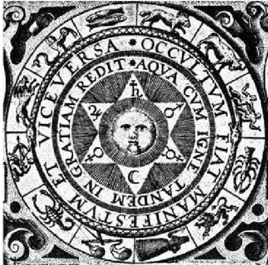
Paracelsian Magic Circle