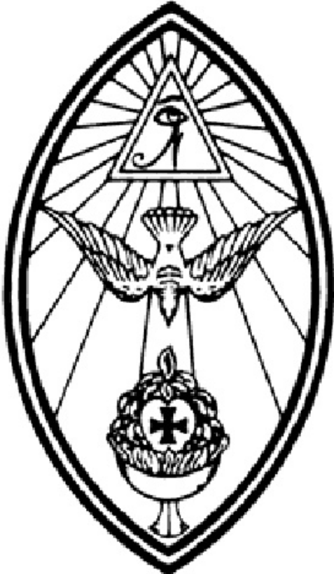
Crowley's OTO logo