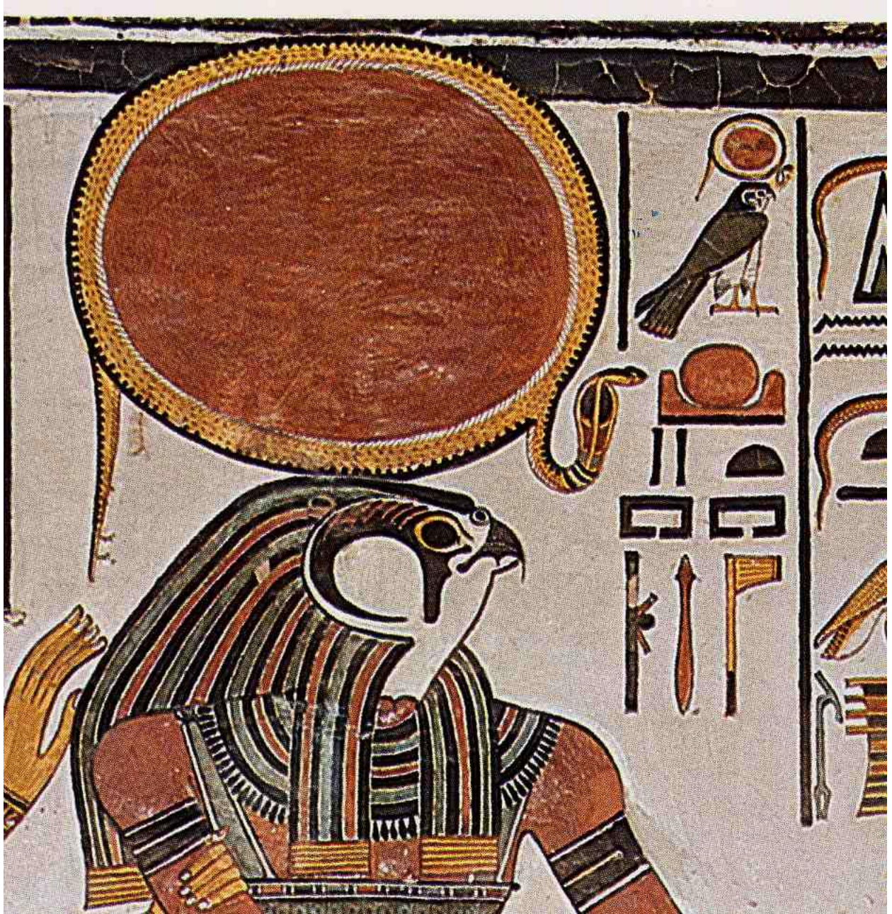
Horus, or tammuz, (nimrod reincarnated), god of falconry and war.