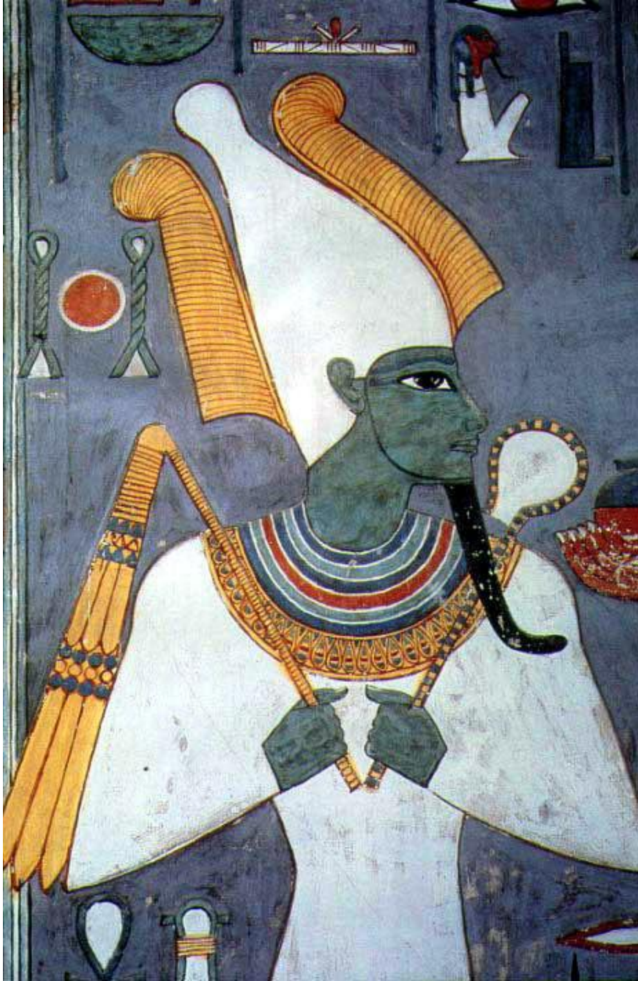
osiris – god of the underworld (nimrod – satan) king of the gods