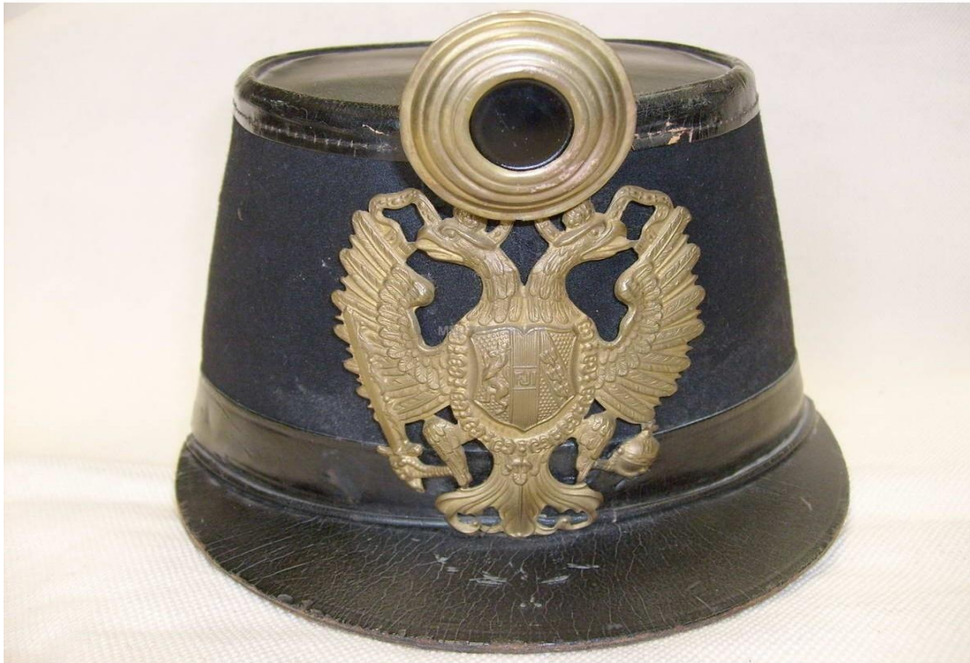
Austrian WW1 infantry Czako cap model 1908

the two heads denoting the union of Rome and Germany, in AD 802.