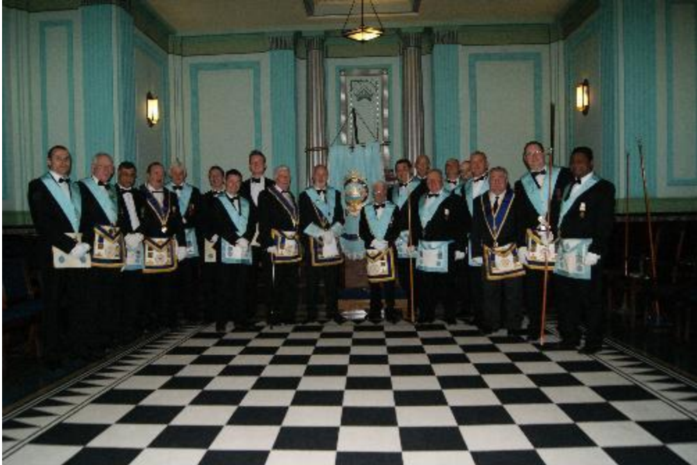
Freemasons Hall, Queen Street London

Another is that it represents good and evil, light and dark and the merging of species (nephilim). (merging of two worlds)