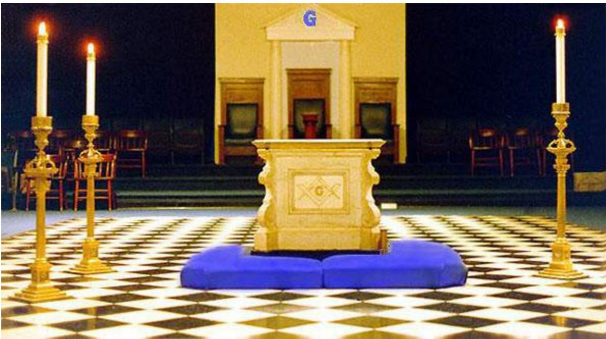
Freemason altar and three lesser lights (three phases of the sun)

Another is that it represents good and evil, light and dark and the merging of species (nephilim). (merging of two worlds)