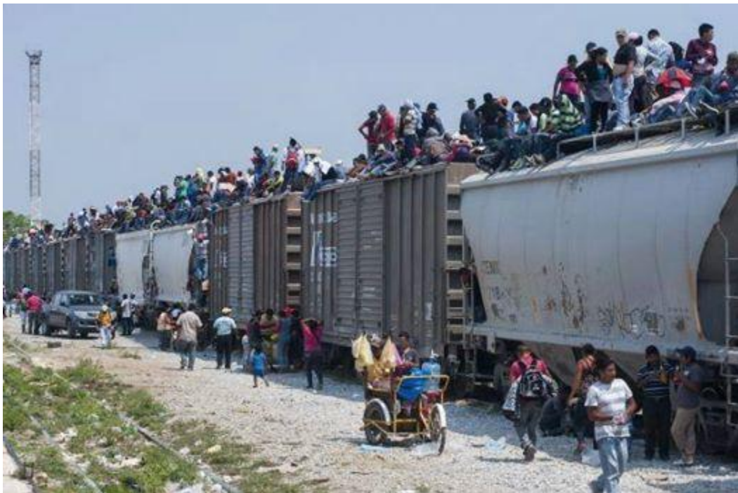
Illegal Crossing at the Texas – Mexico Border

We are being told that much of the ammunition being bought is for border patrol yet our borders are wide open. No one is being shot there.