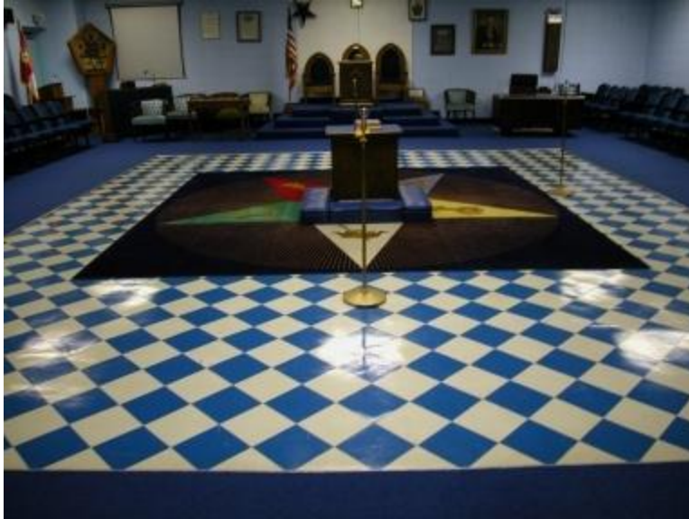
Pentagram in the center