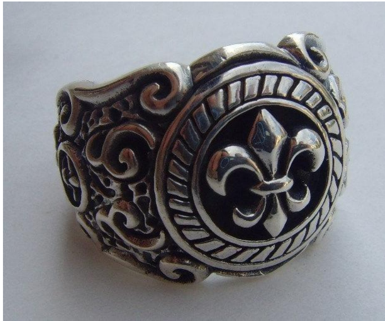
Ring from Free Masonry – Knights Templar