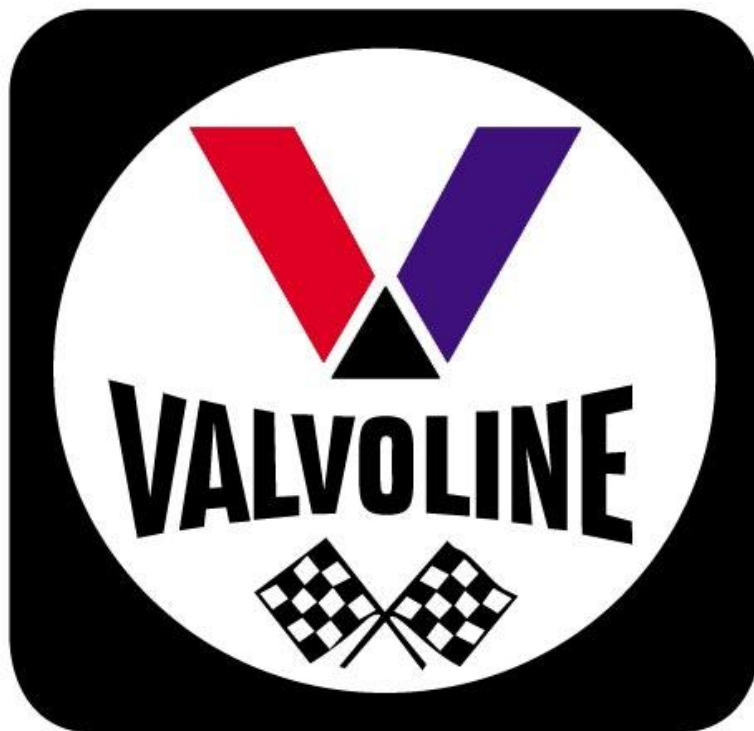
Red and Blue / Triangle – Egyptian Pyramid / Black and White Checkered Flags