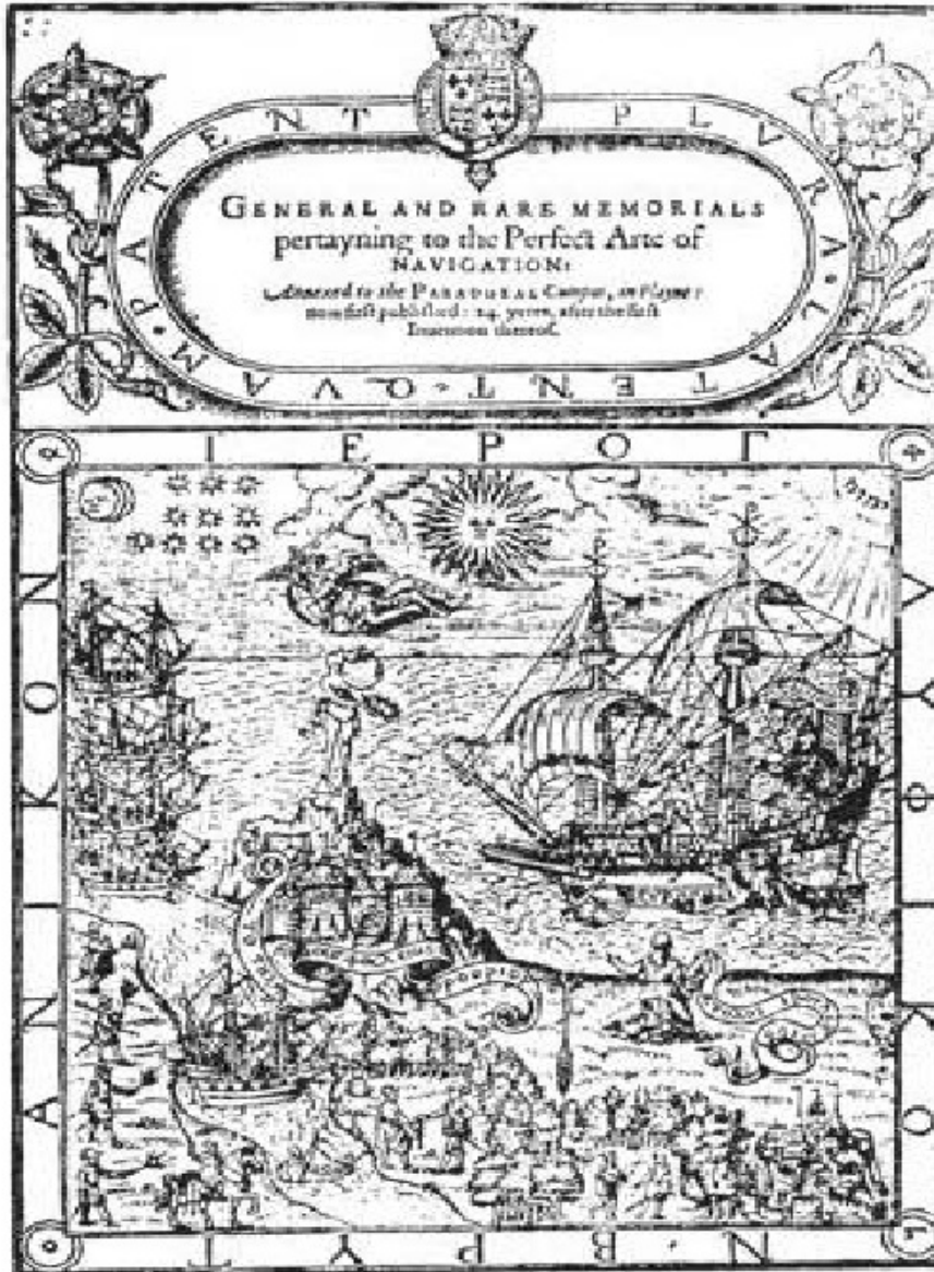
11 John Dee, General and rare memorials , 1577, title-page

Thus, the first legal agreement or constitution in the New World was followed in 1661 by a Declaration of Liberties, dated June 10, 1661, in General Court, which included: "2. The Gouvernor & Company are, by the pattend, a body politicke, in fact and name. 3. This body politicke is vested with power to make freemen .... " This Declaration is an important document in the history of this nation, because It announced that we now possessed the power of sovereignty, that is, the right to make freemen. On October 2, 1678, the colonists boldly announced that "the laws of England are bounded within the fower seas, and doe not reach America."