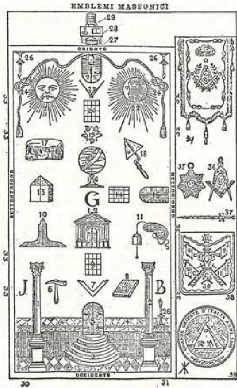
EMBLEMS OF MASONRY

the FBI. Because of this association, it proved impossible to remove him from the FBI during his lifetime.